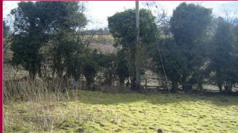
View south from adjacent plot H towards southern boundary.