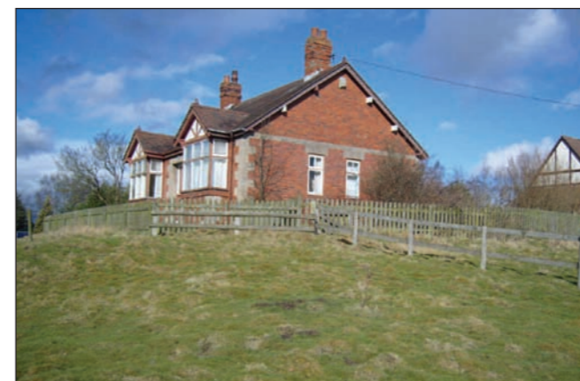
View north towards front and side elevations of Hillcrest.

Hawkmoor for themselves and for the vendors of properties whose agents they are, give notice that the particulars and information package are set out in general outline and do not constitute or form part of an offer or contract. They are not to be relied upon as statements of representation or fact. All descriptions, dimensions (measured approximately as a guide only), reference to condition and necessary permission for use and occupation are given without responsibility to any intending purchaser. Purchasers must satisfy themselves by inspection or otherwise as to the correctness of them. No person acting on behalf of the vendor or agent has authority to make or give representation or warranty on any property. Please contact Hawkmoor if you require additional information or clarification on any points. Any plans reproduced with these particulars and information pack are not to scale.