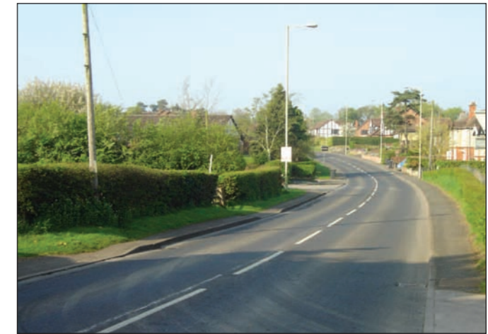
View south west along Newcastle Road site frontage.