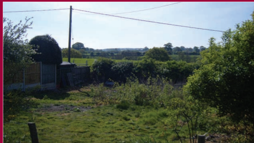
View east towards eastern boundary.