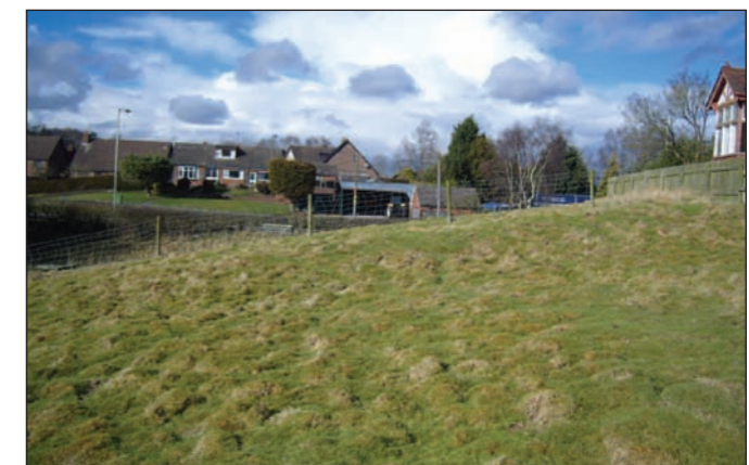
View north from adjacent plot H towards Newcastle Road and Hinsley View.