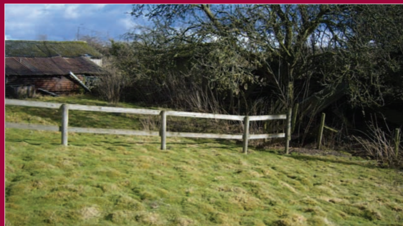
View east towards southern boundary.