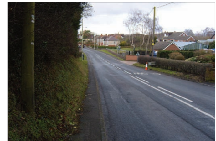
View south west along Newcastle Road site frontage.