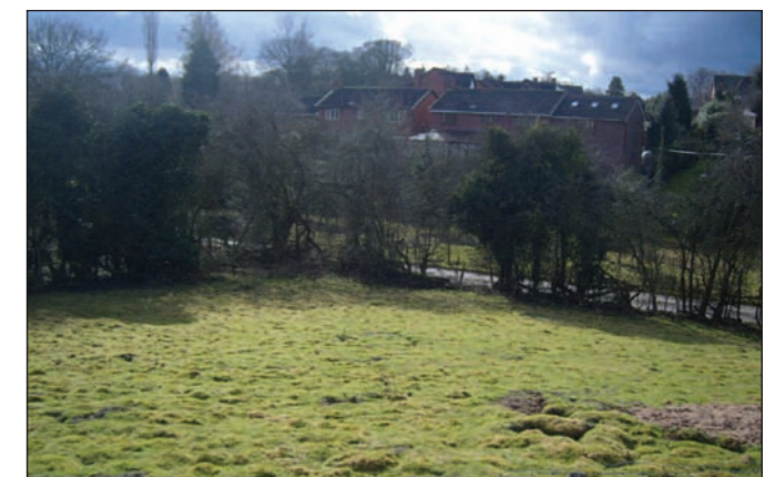
View south from adjacent plot H towards Tern Fisheries access and Millfield Drive.